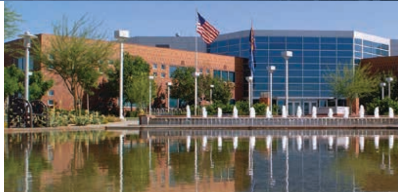
FINANCIAL AND PHILANTHROPIC PLANNING IDEAS