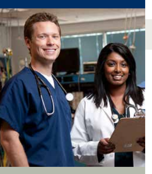
Midwestern University students receive the highest quality in healthcare education.

© Midwestern University and Sharpe Group 2014. All rights reserved. The Heritage Circle is a trademark and service mark of Midwestern University. No part of this publication or any of the planned giving information published on the websites or in the brochures or guides referred to herein can be reproduced or used for any purpose (other than the purpose for which such materials are delivered or made available to the original recipient) without advance prior written permission of Midwestern University, or Sharpe Group.