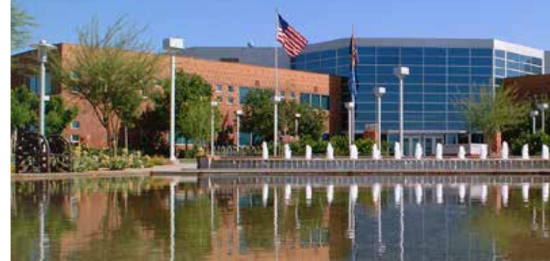
FINANCIAL AND PHILANTHROPIC PLANNING IDEAS